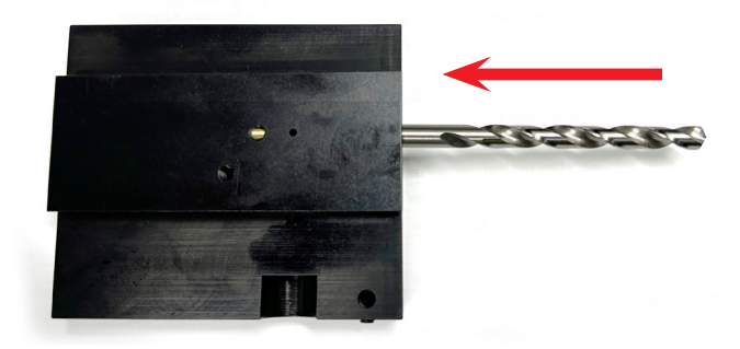
FIGURE 1—Tap the drill bit in the direction of the red arrow to force the slide scew insert nut out (mill X/Y saddle show for reference).

Place the drill in the clearance hole "shank end in." Then tap the end of the drill bit to force the slide nut out (see Figure 1).