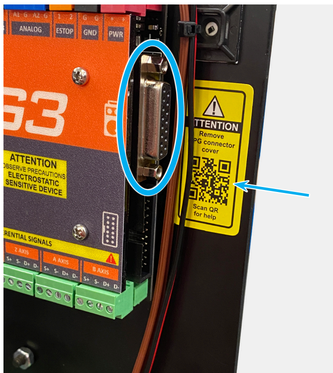
FIGURE 1—The blue arrow points to the MASSO QR code. The blue oval shows the location of the DB15 female connector.