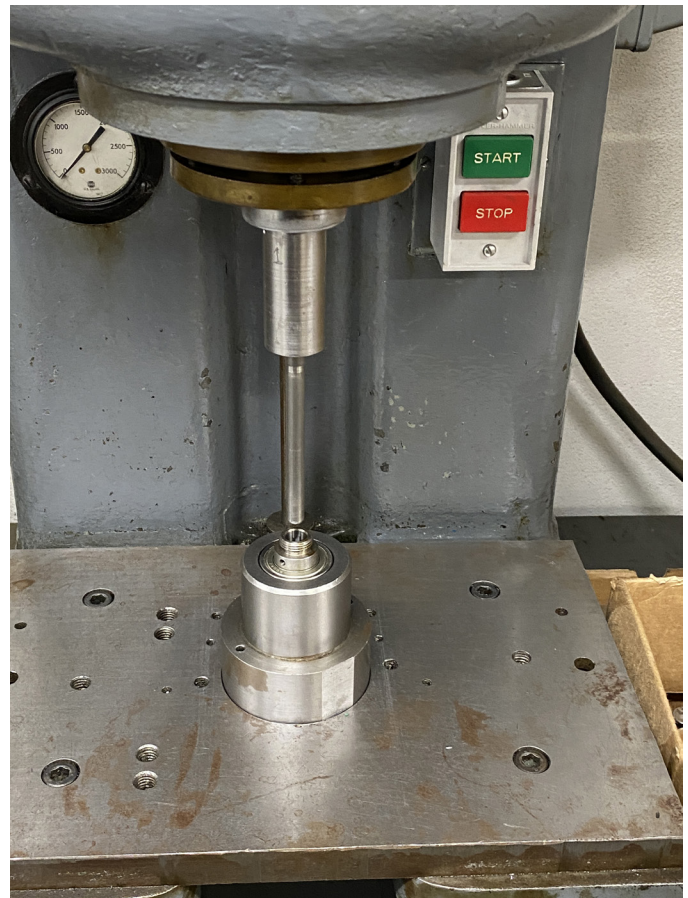
FIGURE 2— This is a picture of one of our alignment fixtures, mounted to our hydraulic press, to press the front bearing onto the spindle.