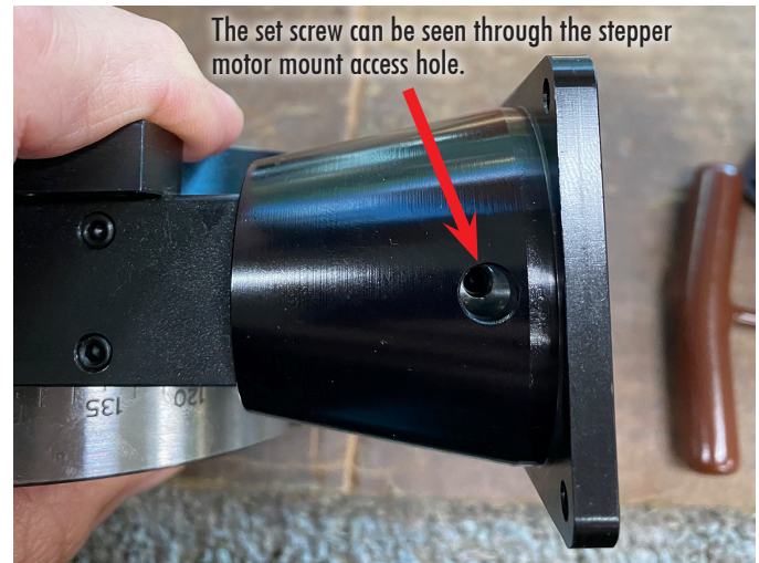
FIGURE 1— The set screw is aligned with the access hole.

NOTE: Please refer to the exploded view on page 3 of these instructions for all P/N references.